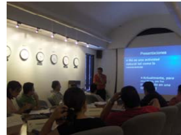
Seminaries In House