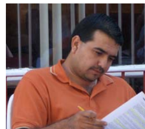
We go deep

students take a seminar at Sicap, becomes a life experience for life. In some cases we hand over group profiles when the companies requested